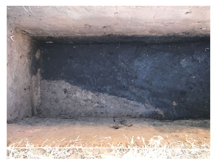
This is the floor of pit L55 at 40 inches. As we excavated deeper the vertical soil interface became very distinct. The soil on the northern part of the pit became darker enhancing the contrast with the lighter soil to the south.

For the past several weekends, FBAS members have been working in Pit L55. In the pit, there is a distinct straight line between contrasting colors of soil type and color. A feature such as this does not occur naturally. It is evidence of a hole that was dug by someone in the past and later filled back in. More work needs to be done to see the extent of this feature. Knowing the size and shape of the feature may offer clues as to what it was. FBAS members dig every Saturday and welcome anyone who would like to help. If you are interested in joining please contact us. No experience necessary – we'll help train you with the proper methods of excavating!