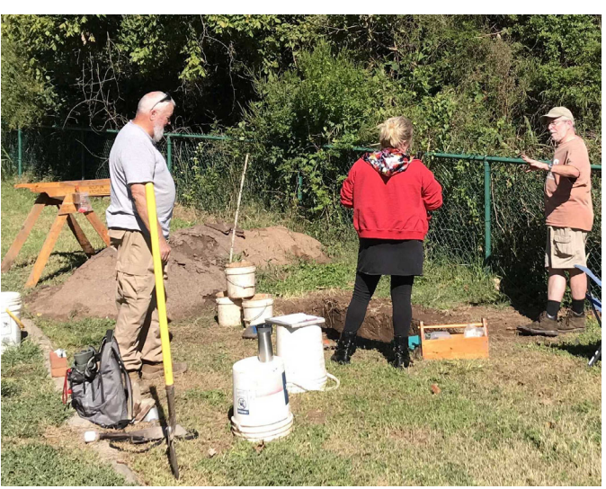
The team takes a moment to step back and discuss the bigger picture of what's being uncovered.