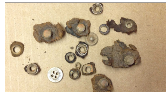
Artifacts discovered in the Lamar cistern.