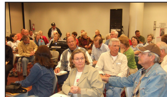
Regular meetings take place on the second Tuesday of the month at Gus George Academy in Richmond.

The Tyree House is adjacent to the Fort Bend Museum Complex and relies upon the volunteers and full-time staff for guidance and assistance.