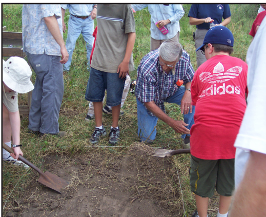
A Boy Scout dig at the George Ranch Historical Park.

The present Fort Bend Archeological Society (FBAS) headquarters are in the Tyree House, which is provided to the FBAS by the Fort Bend History Association.